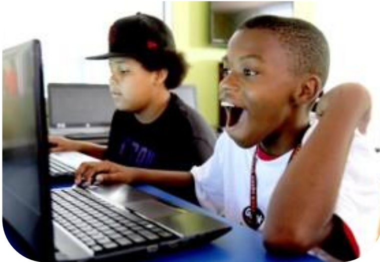
Geek Squad Academy

Our pathway of programs connects young people with resources to realize their potential and channel their talent, energy and ideas into brighter futures.