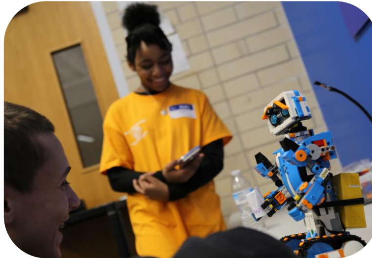
Best Buy Teen Tech Centers